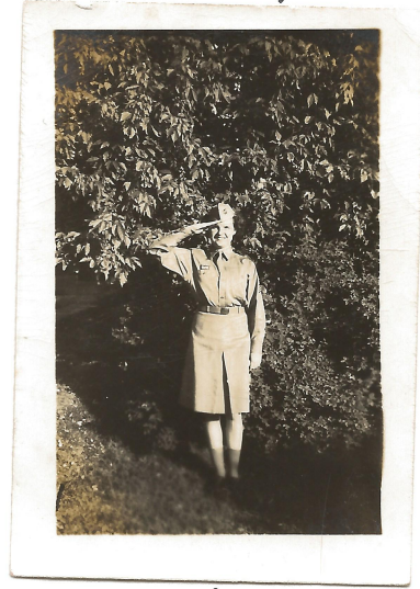
Civilian Air Patrol 1947