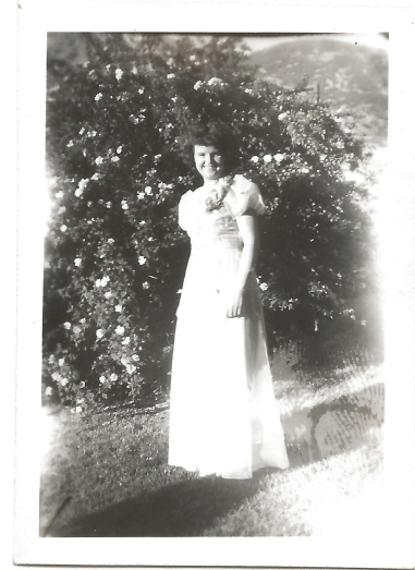
High School Graduation