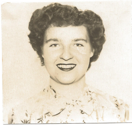
Taken before leaving on her mission.